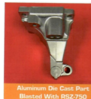
Aluminum Die Cast Part Blasted With RSZ-750

*Cast Zinc Shot will not open porosity or delaminate cast parts