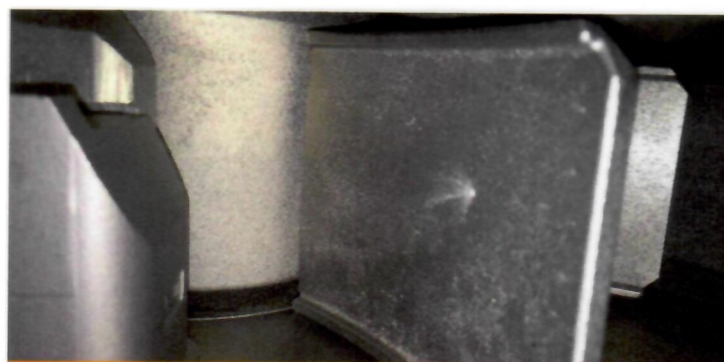
Blast Wheel After 17,000 Hours With Cast Zinc Shot